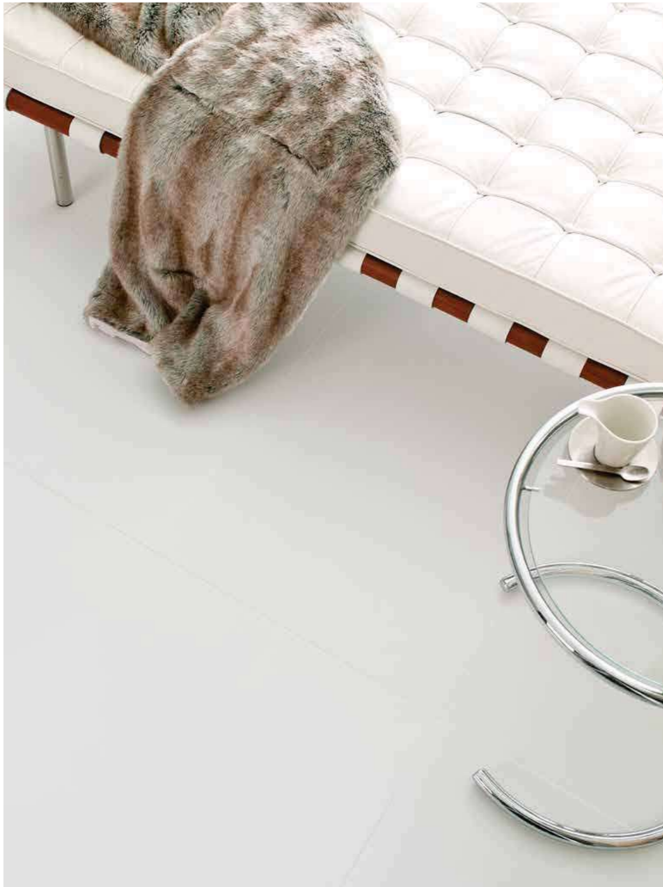
# EXTREME WHITE 59.6x120cm