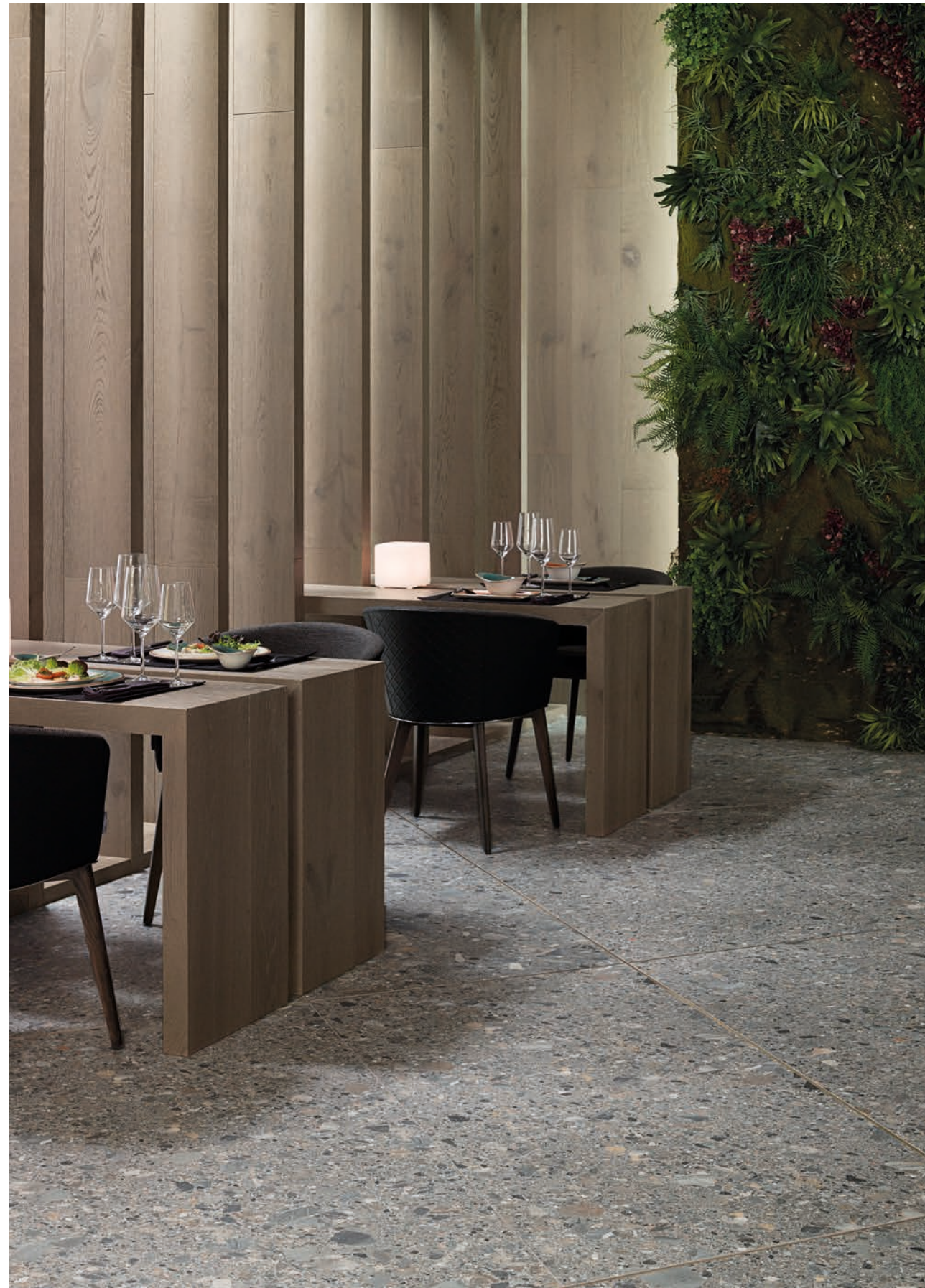
PAVIMENTO: CEPPO STONE 80x80cm