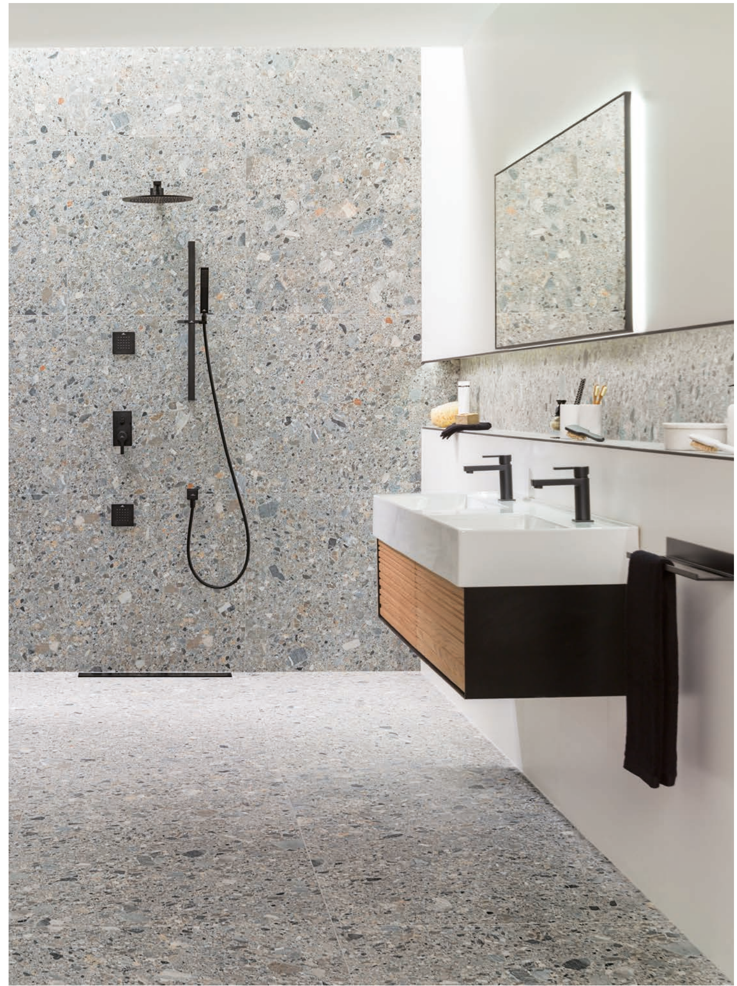
PAVIMENTO: CEPPO ACERO 80x80cm