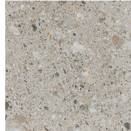
CEPPO ACERO 80x80x1,1 cm P1760155 / 100226457 G369 HIGHKER Butech recomienda junta / Butech recommends joint: Colorstuk Rapid n Cemento B21522249/100236449