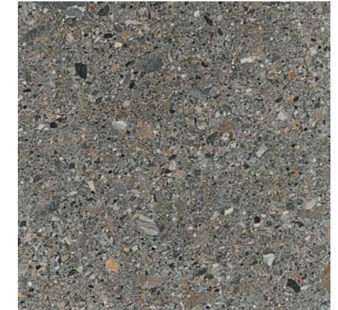
CEPPO ANTRACITA 80x80x1,1 cm P1760156 / 100226594 G369 HIGHKER Butech recomienda junta / Butech recommends joint: Colorstuk Rapid n Antracita B21522250/100236481