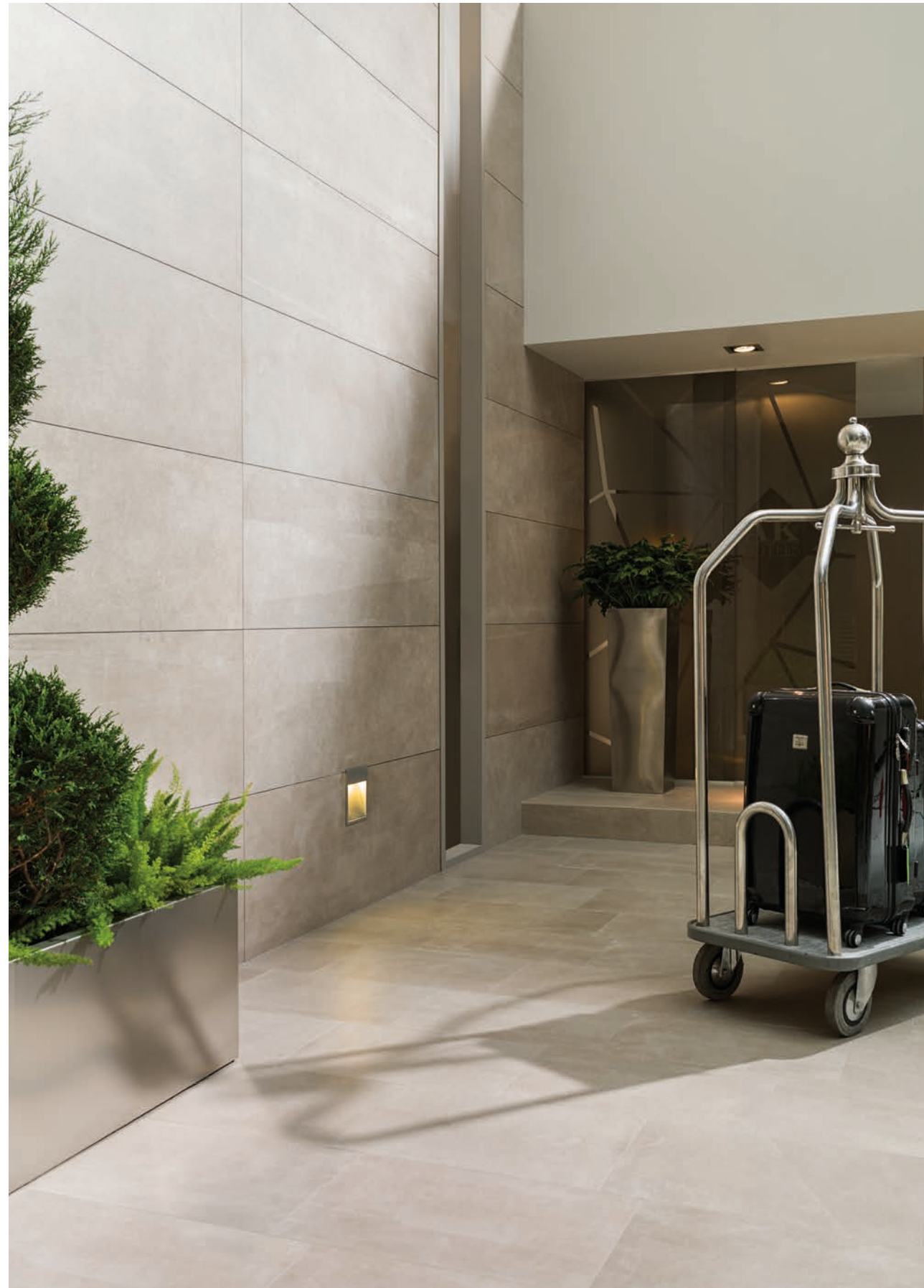
PAVIMENTO: BOSTON TOPO 43,5x65,9cm | REVESTIMIENTO: BOSTON TOPO 59,6x180cm