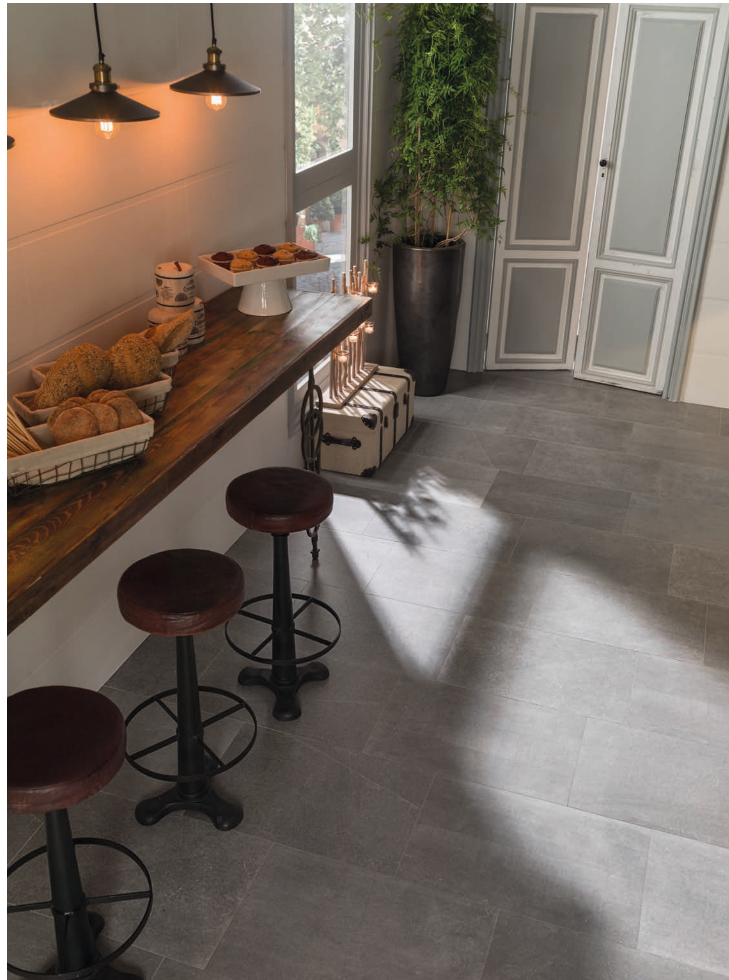
PAVIMENTO: BOSTON STONE 43,5x65,9cm