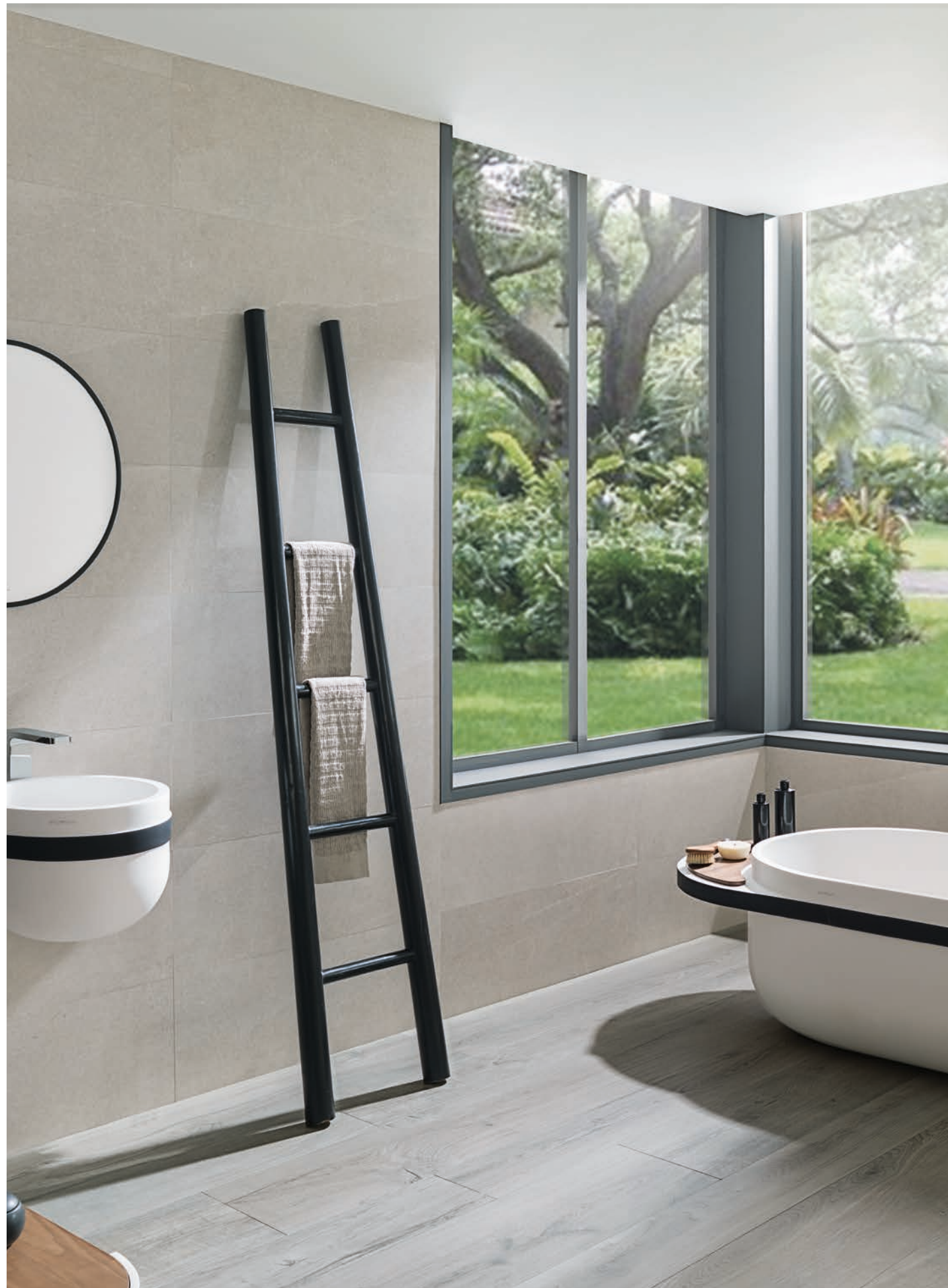
REVESTIMIENTO: BOSTON BONE 31,6x90cm