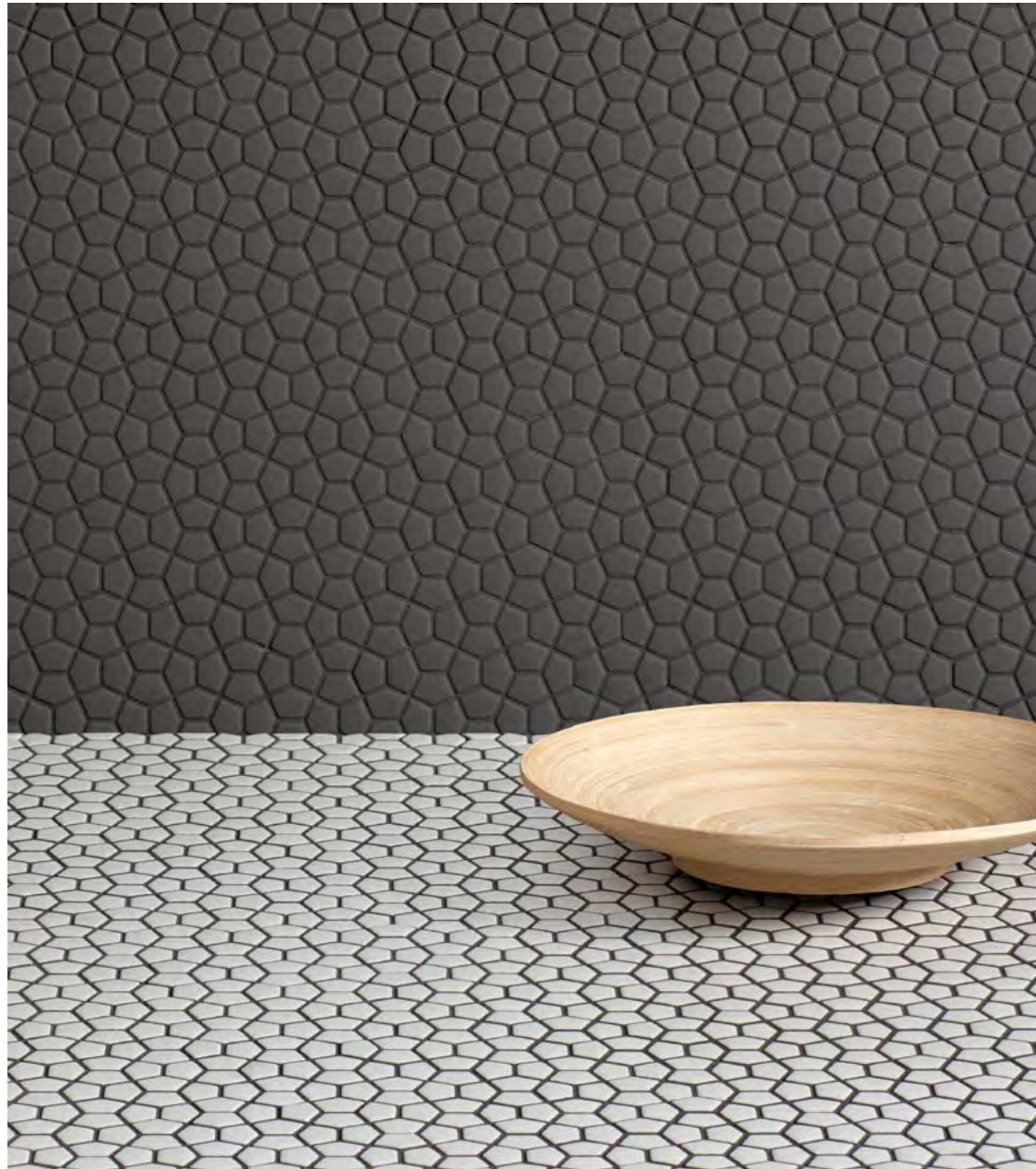
D.MOSAIC KIN CLOUD · D. MOSAIC KIN ICE

MOSAIC KIN by DSIGNIO represents the evolution of the KIN wall tiles which were also designed by this studio, now adapted to the world of mosaics whilst retaining all their authenticity. Just like its predecessor, MOSAIC KIN by DSIGNIO is based on the hidden mathematical rules of nature, featured in reticules in which various pentagons converge, forming a series of interwoven hexagons. In this case, the wall tiles are made up of hundreds of tiny pieces of glass, reminiscent of cells, that come together to create a tissue or skin that provides a covering for spaces.