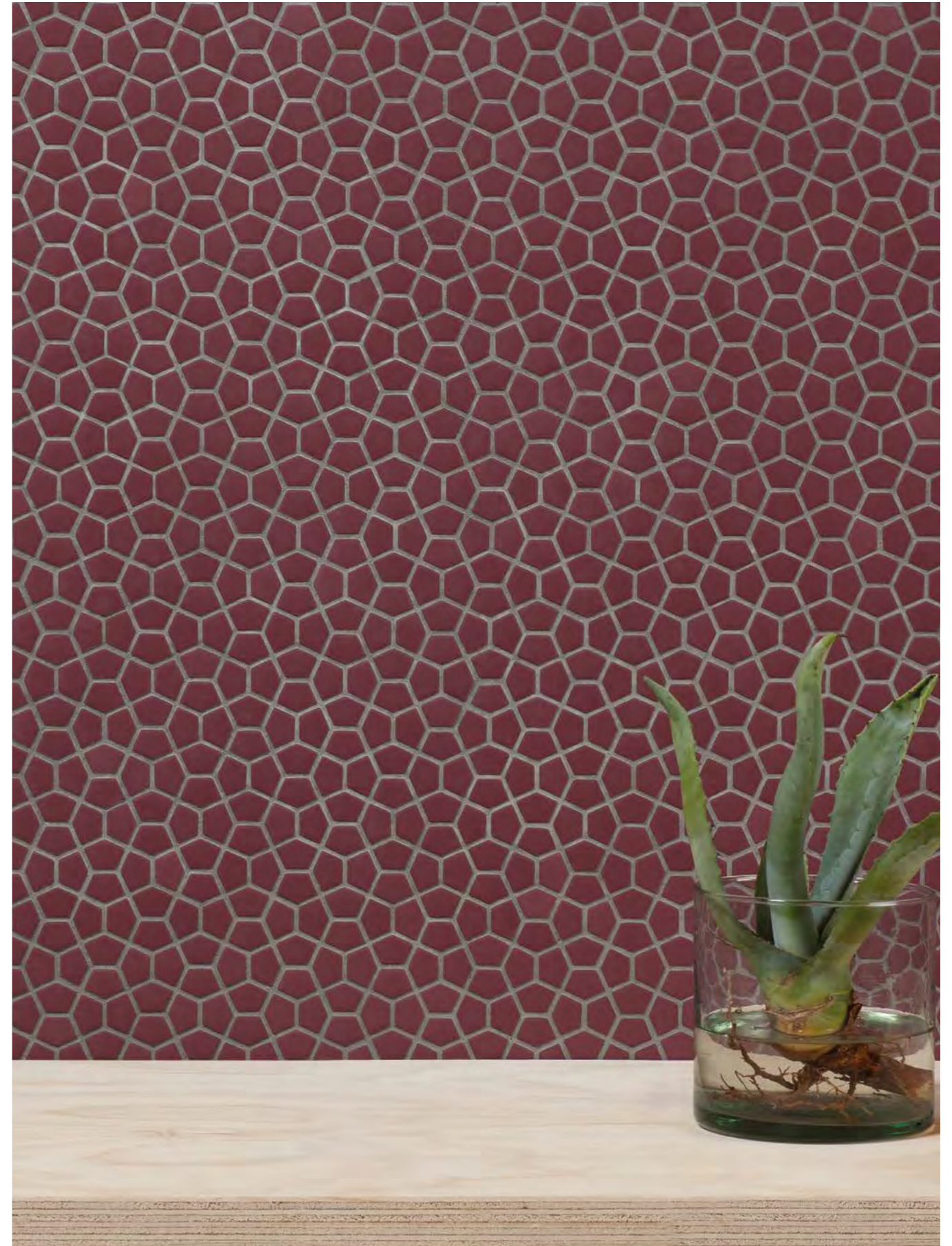
D.MOSAIC KIN BORDEAUX

MOSAIC KIN by DSIGNIO es la evolución del revestimiento KIN, también diseñada por este estudio, adaptándolo al mundo del mosaico, pero sin perder su esencia. Al igual que su predecesor, MOSAIC KIN by DSIGNIO está basado en la matemática oculta en la naturaleza, en las retículas donde varios pentágonos se unen para crear hexágonos entrelazados. En esta ocasión, el revestimiento está formado por cientos de pequeños cristales que, como si fueran células, crean un tejido, una piel con la que cubrir los espacios.