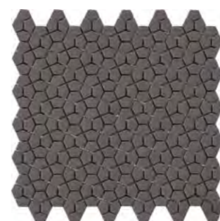
20126 D.MOSAIC KIN CLOUD H5 (30,5x30,5 cm — 12x12")