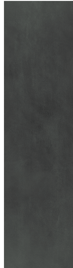
Nero - F6379 - 3+ (Walls) - Stocking

Note! These samples depict base color and sheen. Please refer to our website for a more accurate depiction of veining and pattern.