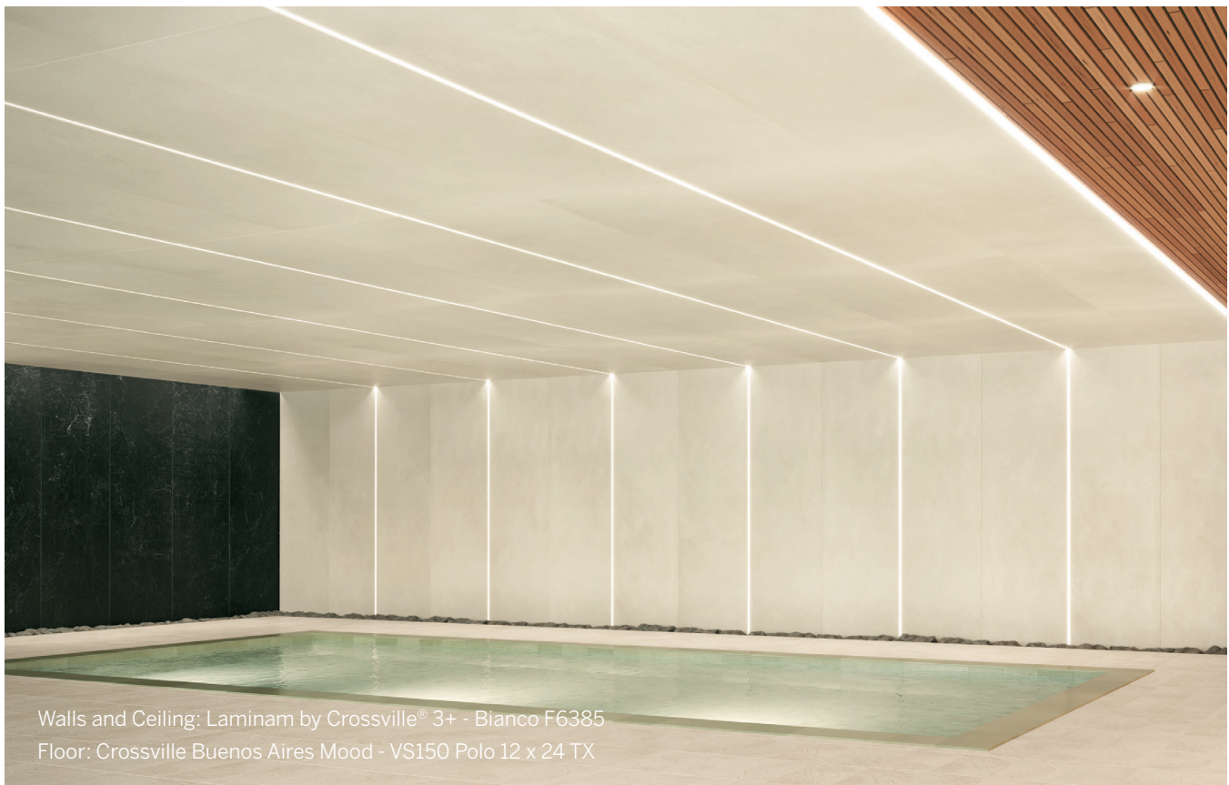
Walls and Ceiling: Laminam by Crossville® 3+ - Bianco F6385