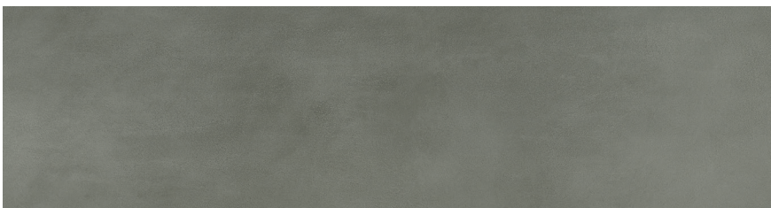
Antracite - F6373 - 3+ (Walls) - Stocking