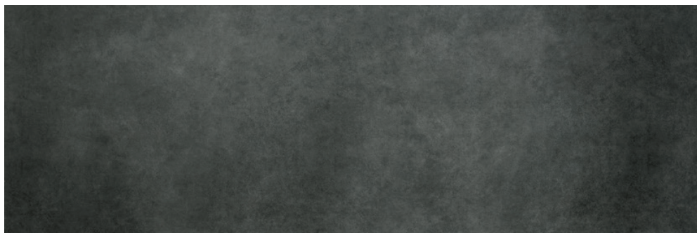
Nero - L1510 - 3+ (Walls) - Stocking