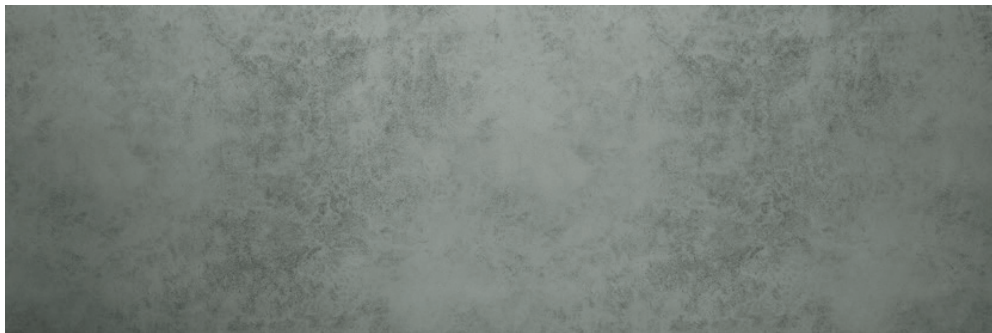
Grigio - L1367 - 3+ (Walls) - Stocking