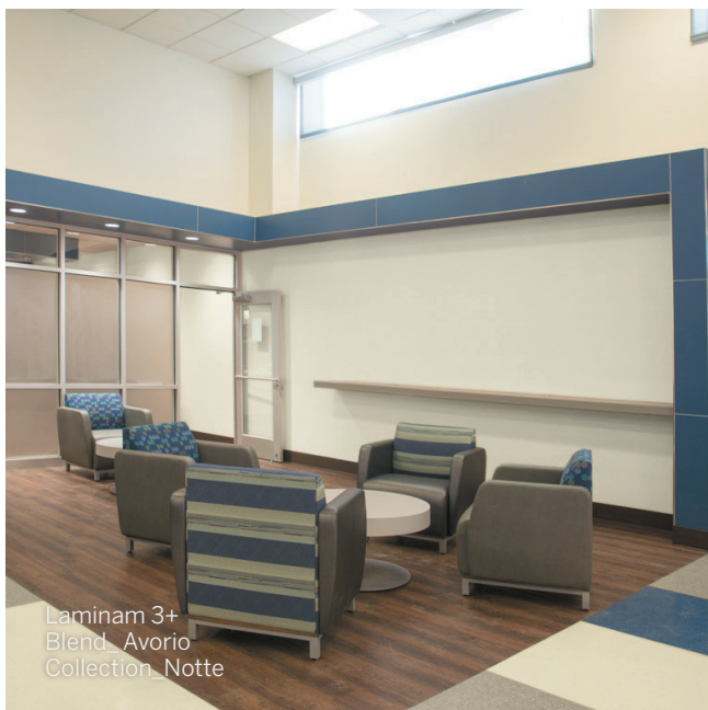
Laminam 3+ Blend_Avorio Collection_Notte

** Special Order Items are only sold in full crate quantities.