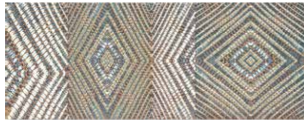
DECOR ETHNIC 35x90 cm / 14"x36" | E-250