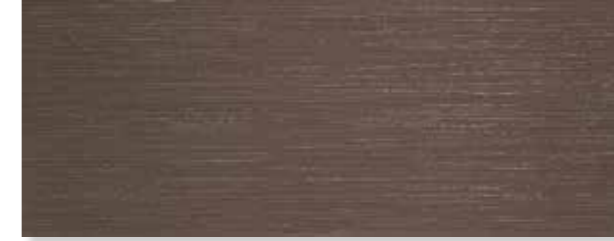
SHUI BROWN DROPS 35x90 cm / 14"x36" | W-091