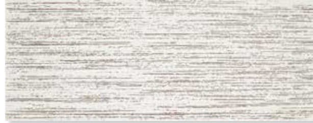
SHUI WHITE DROPS 35x90 cm / 14"x36" | W-091