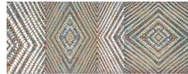
DECOR ETHNIC 35x90 cm / 14"x36" | E-250