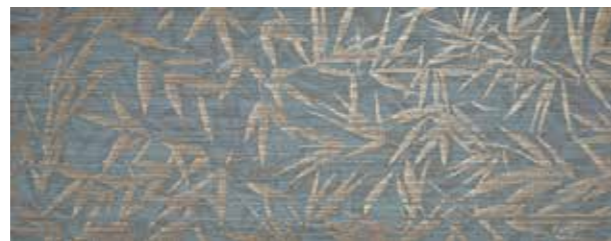
SHUI TEAL LEAVES 35x90 cm / 14"x36" | W-095