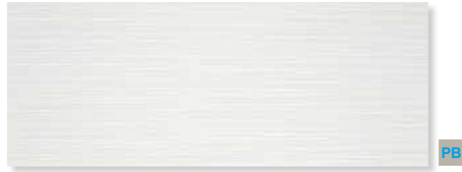
SHUI WHITE 35x90 cm / 14"x36" | W-090