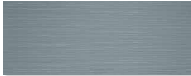
SHUI TEAL 35x90 cm / 14"x36" | W-090