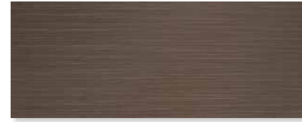
SHUI BROWN 35x90 cm / 14"x36" | W-090