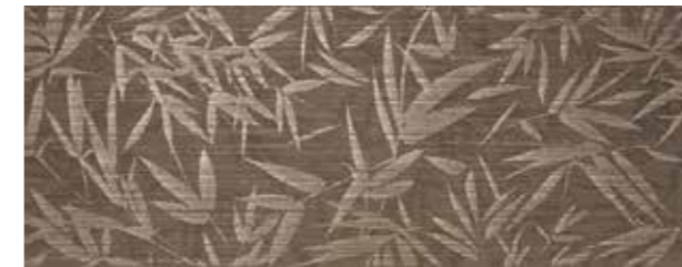
SHUI BROWN LEAVES 35x90 cm / 14"x36" | W-095