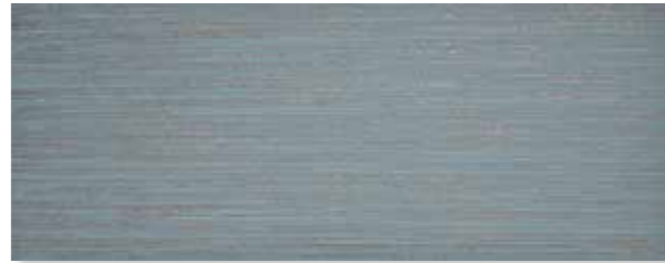
SHUI TEAL DROPS 35x90 cm / 14"x36" | W-095