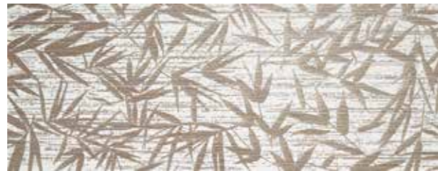
SHUI WHITE LEAVES 35x90 cm / 14"x36" | W-095