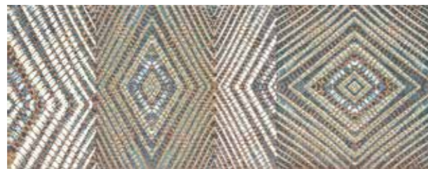
DECOR ETHNIC 35x90 cm / 14"x36" | E-250