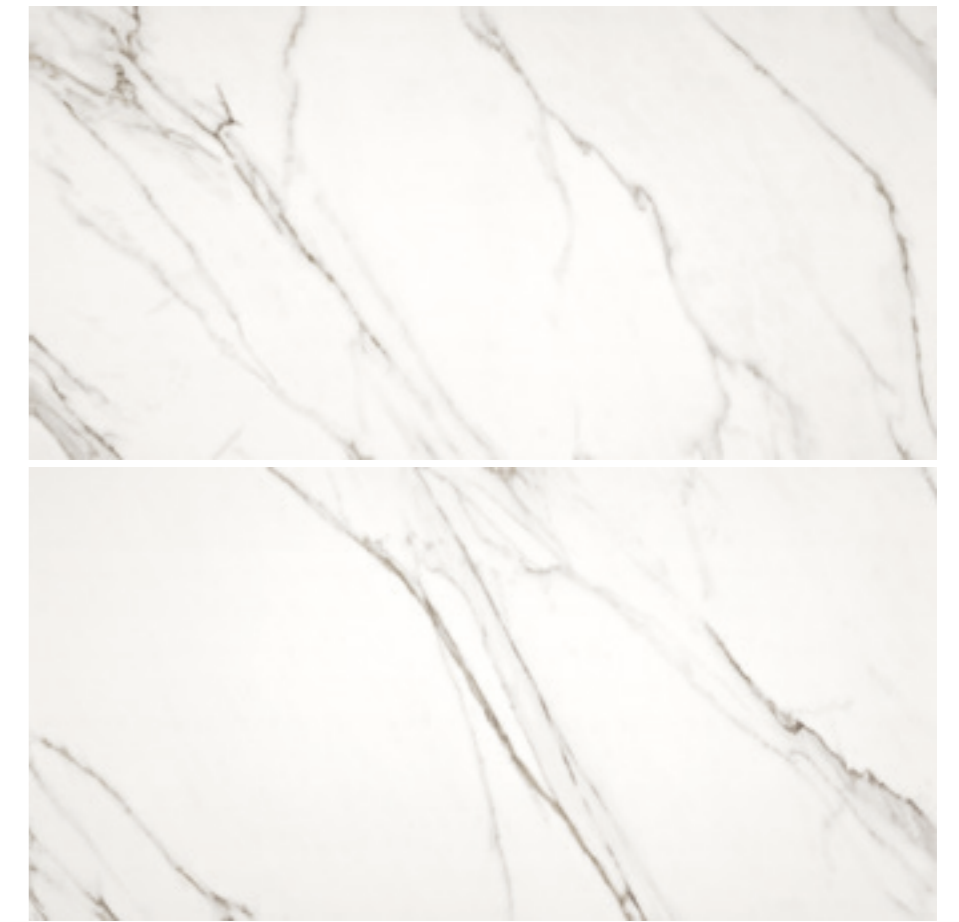
Aston White Rect. G460R