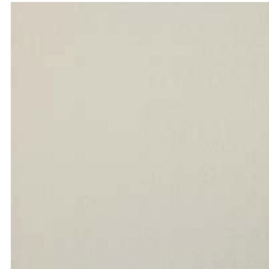
HD 01 40x40 (16x16") - 30x60 (12x24") - 60x60 (24x24") 30x120 (12x48") - 60x120 (24x48")