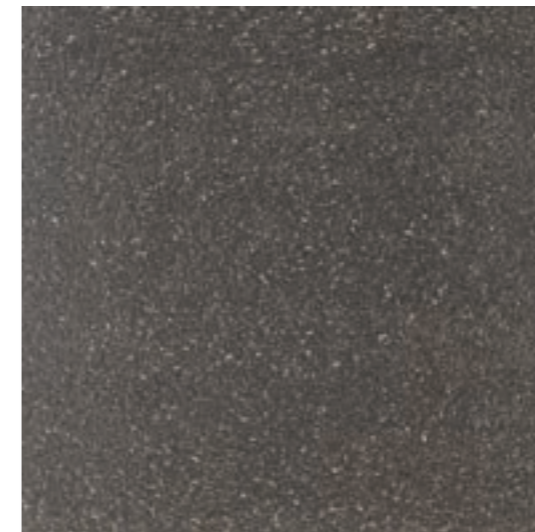
HD 03 40x40 (16x16") - 30x60 (12x24") - 60x60 (24x24") 30x120 (12x48") - 60x120 (24x48")