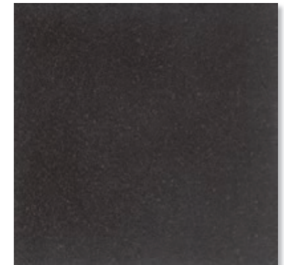
HD 04 40x40 (16x16") - 30x60 (12x24") - 60x60 (24x24") 30x120 (12x48") - 60x120 (24x48")