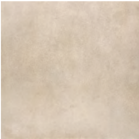
REIMS Vison 60x60 · 23,4" x 23,4" PP0701