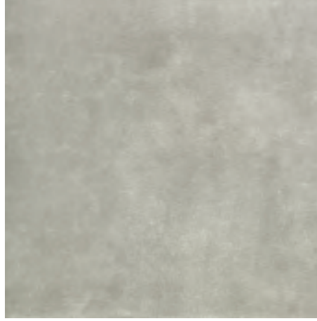
REIMS Marengo 60x60 · 23,4" x 23,4" PP0701