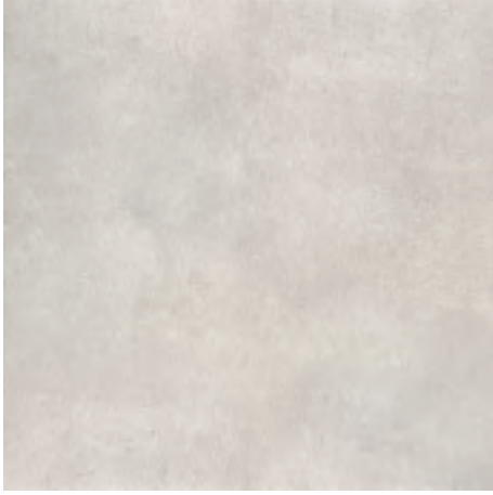
REIMS Gris 60x60 · 23,4" x 23,4" PP0701