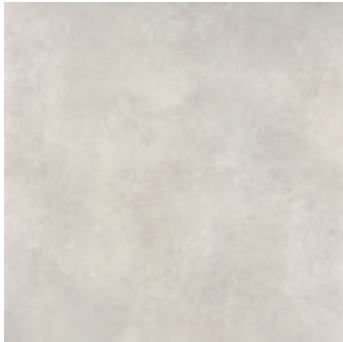
REIMS Gris 45x45 · 17,7"x17,7" PP0801