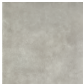
REIMS EXT. Marengo 45x45 · 17,7"x17,7" PP0802