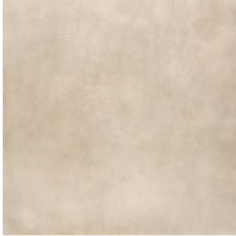
REIMS Vison 45x45 · 17,7"x17,7" PP0801